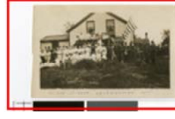
Year, Month and Day