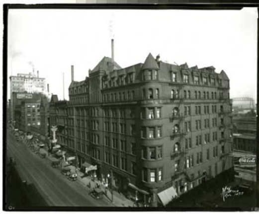
Aerial Bridge: Spalding Hotel with Bridge